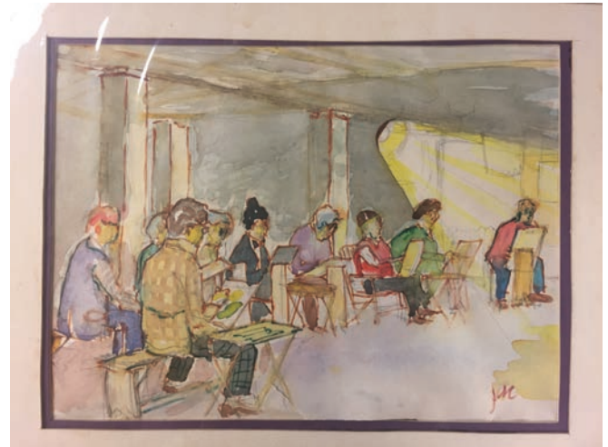
Sketch of WSC sketch night...long ago, artist unknown

1. The Space: The facility is clean and very well maintained. We'll be sketching in a spacious well-lit room on the second floor of the Community Club. There is enough space for lots of members and drop-in artists to gather around a model, with possibilities of sketching in rows of seated and standing artists as we have been doing, or who knows — even sketching 'in the round' for a figure drawing night.