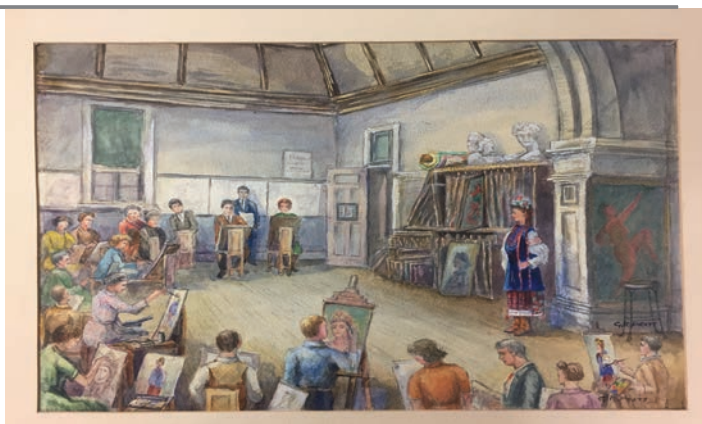
Another great sketch of WSC long ago - artist unknown