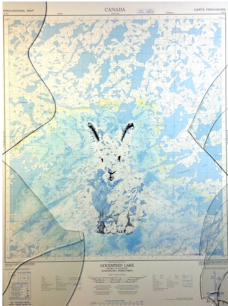
Judge's Choice Goodspeed Lake, Kathleen Black