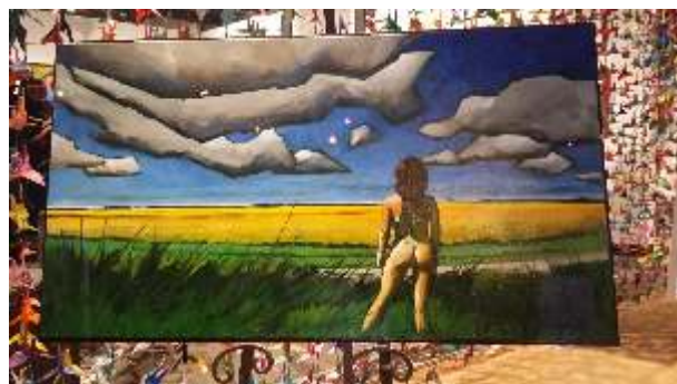
David Cooper's work here adorning the gallery entrance window.

If you missed the show some work is still on view in the side window. Check it out.